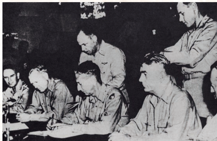
The Armistice Agreement ending the Korean War was signed, on July 27, 1953, by Kim Il-sung (left) and UN commander Mark Clark (right). Meanwhile, regardless of the worldly environment, Father focused his "whole self on realizing God's will."