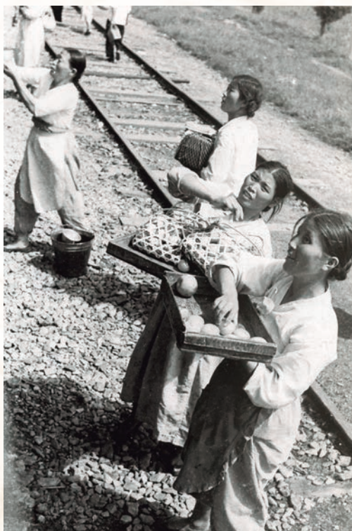
When Father started his mission in the South, life there was grim; 3 million North Korean refugees only made matters worse. Here, mothers sell fruit at a train station in 1954.

In relation to this point, speaking of his environment, Jesus said, "Foxes have holes and birds of the air have nests, but the Son of Man has no place to lay his head." It was my destiny to experience almost the same thing in my life. TW